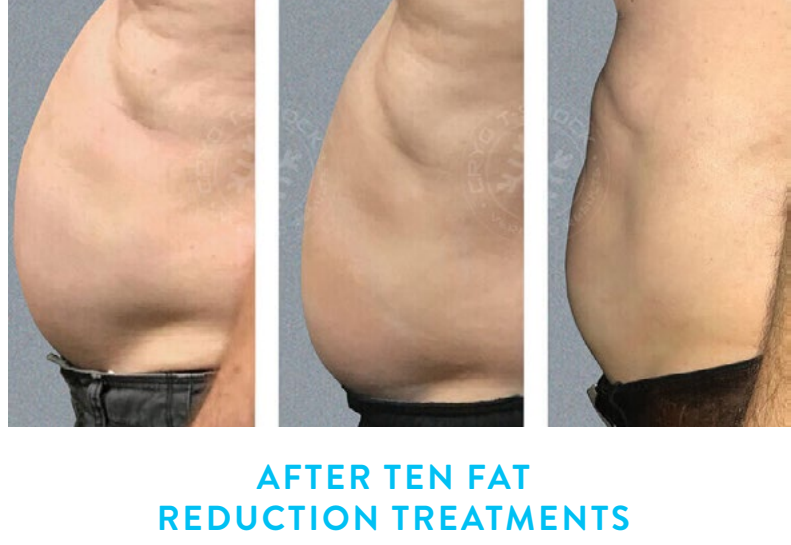
AFTER TEN FAT REDUCTION TREATMENTS