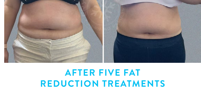
AFTER FIVE FAT REDUCTION TREATMENTS

Eliminate unwanted fat cells, reduce cellulite and tone and tighten the skin with the STAR T-Shock: the ultimate anti-aging treatment.