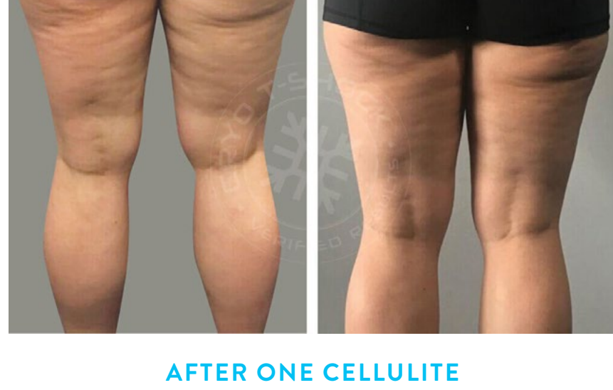
AFTER ONE CELLULITE TREATMENT