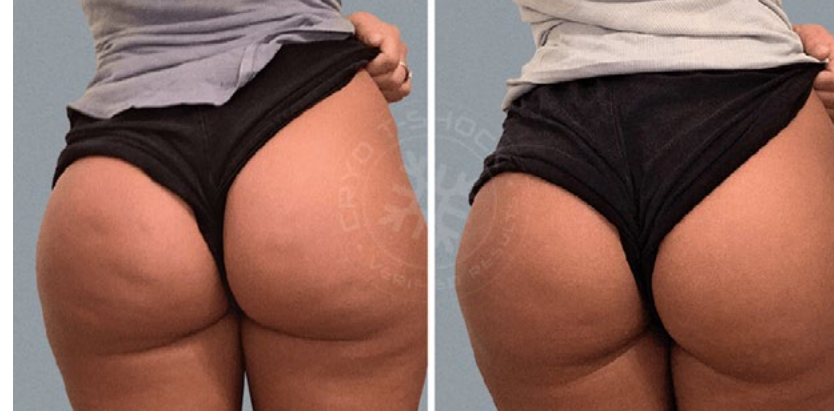
AFTER FIVE CELLULITE TREATMENTS