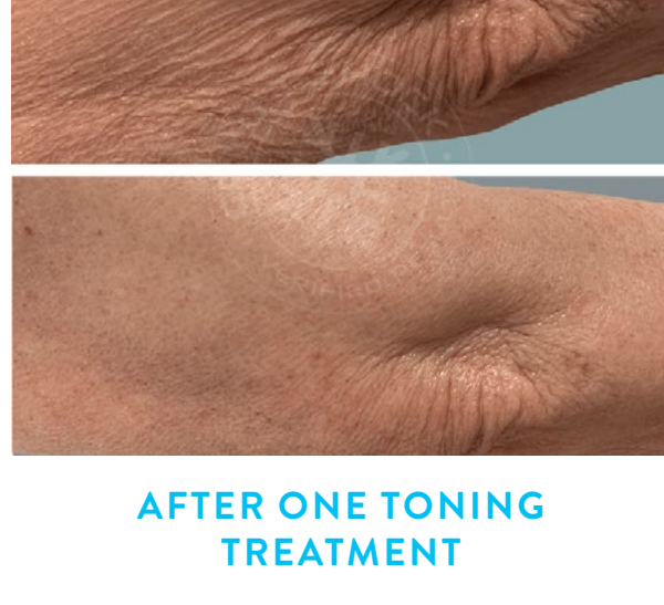
AFTER ONE TONING TREATMENT