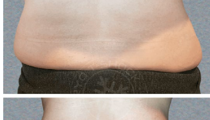
AFTER FOUR SLIMMING TREATMENTS

T-Shock Slimming may require 5 or more sessions over several months to see the best results. T-Shock Toning results are more immediate and also may require multiple sessions to achieve optimal results.